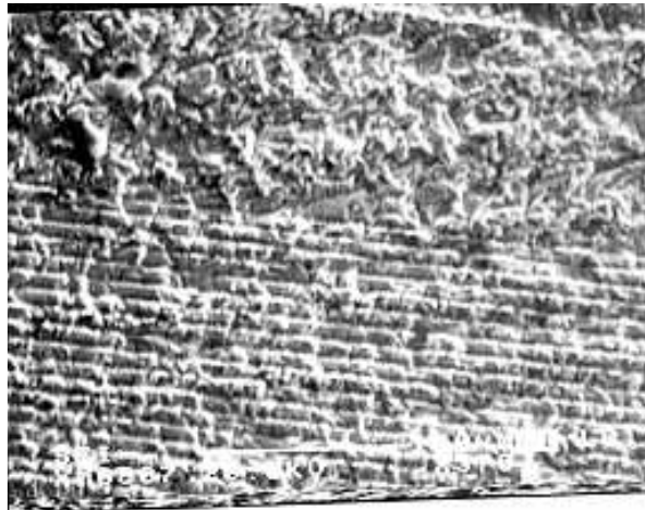
Fig. 2. Surface of a Yb:PPLN sample after an annealing process at T < T_c followed by a quenching process.

B.- For annealing temperatures below the Curie temperature ( T < T_c ), which correspond to annealing processes 1 and 2, the crystal face facing to the bottom of the crucible is also damaged. The upper face appears very rough when a quenching process is used to cool the crystals, but the domain structure does not disappear at all even at the surface of the sample. Fig. 2 shows the surface of a Yb:PPLN sample after an annealing process at T < T_c followed by a quenching to RT where it can be observed that the periodic domain structure is damaged but not destroyed. This effect takes place in Nd:PPLN samples where the surface domain structure does not disappear although is strongly damaged.